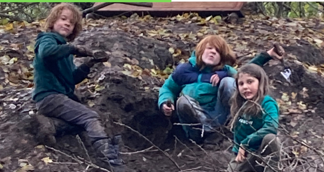
Den building; problem solving, creating, constructing