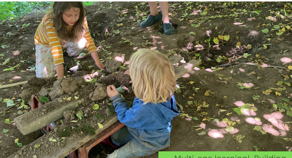
Multi-age learning! Building underground dens!

If you feel that this is something you would like to be involved in please come along to the next meeting, details are posted on WhatsApp and in the Facebook Group